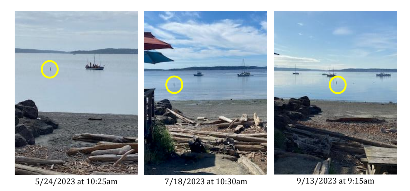
Figure 2. A sample of photos taken by MRC member, Frank, documenting vessel compliance with the Port Townsend No-Anchor Zone (buoys identified with yellow circles).

One MRC member, Frank, diligently monitored the Port Townsend buoy field between October 8 and September 22, with a total of 26 monitoring days recorded. Frank typically monitored from the viewpoint near Better Living Through Coffee, with a couple of observations taken from viewpoints near Adams Street Park and the NW Maritime Center dock, and typically in the mornings, with a few monitoring times recorded in the late afternoon (see Table 1). See a sample of Frank's photos documenting compliant boaters in Figure 2.