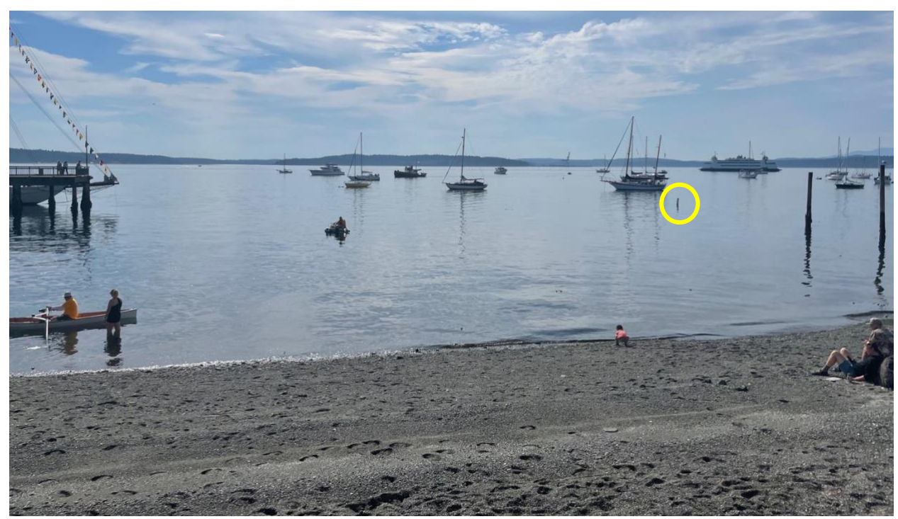
Figure 5. Photo of anchored vessels in compliance with the eelgrass protection no-anchor zone (buoy circled in yellow) during the Wooden Boat Festival (9/10/2023).