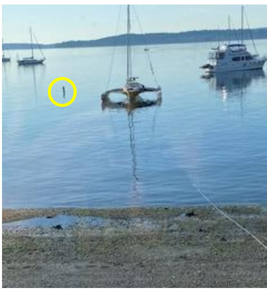
Figure 3. Catamaran appearing to be anchored within the Port Townsend No-Anchor Zone (buoy circled in yellow), but with its anchor placed high up on the shore.

Two additional monitoring efforts were recorded by MRC members, Sarah, on 9/9/2023 and Neil and Brent on 9/10/2023 during the Wooden Boat Festival, bringing the total to 28 monitoring days. On 9/9/2023, Sarah noted a yellow catamaran anchored within the no-anchor zone near Better Living Through Coffee. Upon closer observation, Frank reported that the boat was instead anchored high up the shore, seeming to not disturb the nearshore vegetation (see Figure 3). See monitoring photos taken by Brent on 9/10/2023 in Figures 4-6 and vessel count data sheets attached at the end of this report. No boats were observed to be anchored within the boundaries of the buoys, even during the Wooden Boat Festival which attracts hundreds of boats and thousands of visitors to Port Townsend Bay. This resulted in 100% boater compliance with the Port